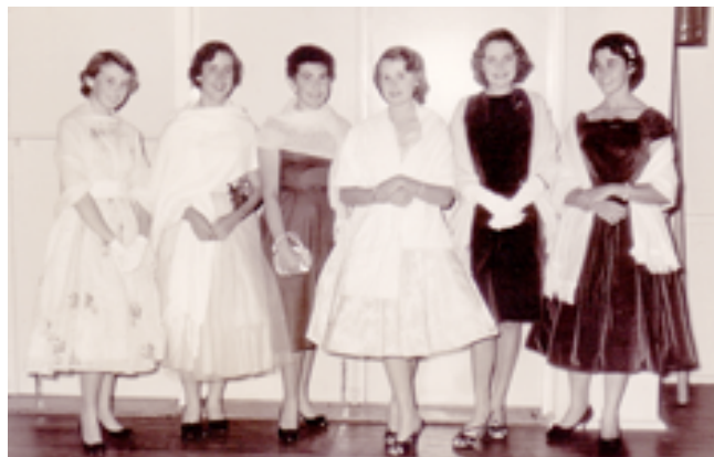
Dressed ready to party in 1959. Are you all ready to party again? Welcome to the 2009 Reunion

BTC 1958-59, invite 1957-58, 1959-60 to join 50th Anniversary Celebrations to be held at Bathurst