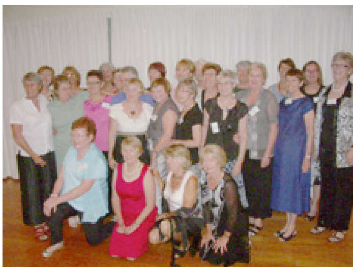
Women from '63-'64

When the official proceedings broke up at 1600, the reminiscences continued in small intimate groups, reliving and reviving the happy shared memories that are special to those of us who had the camaraderie brought about through having our teacher training delivered in a live-in country college.