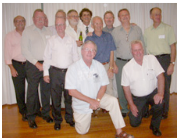
Men from '63-'64