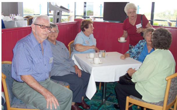
Relaxing at the AGM

Water Feature Fund so that our share of the project, $10,000, was reached! An absolutely marvellous achievement. Thank you all.