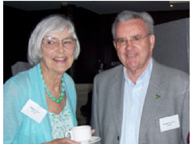
President and Guest Speaker