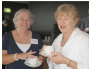
Sub-editors chat over a cuppa

I find it hard to believe that the current copy being assembled is the sixteenth