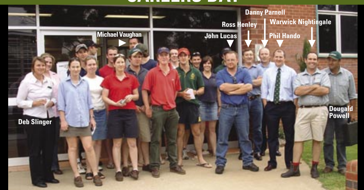
WAC students of 2nd & 3rd year, WACOBU representatives and guest speakers attend Careers Day 2004.