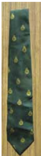
WACOBU Tie $30.00