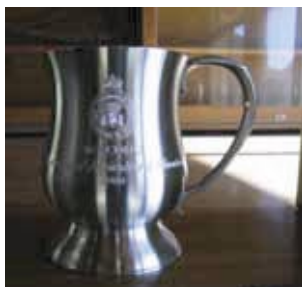
WACOBU Pewter Mug - $50.00