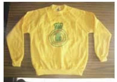
WACOBU Sloppy-joe Price - TBA