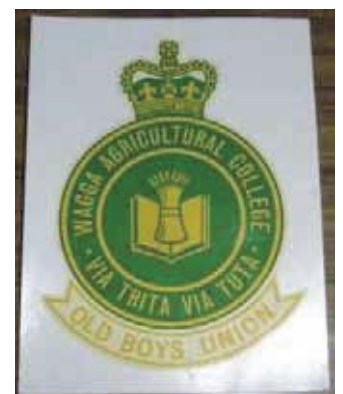
WACOBU Car sticker $1.00