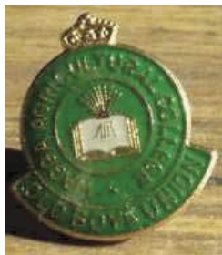
WACOBU Lapel Badge - $2.00