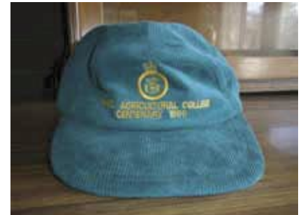
WACOBU Centenary Cap - $12.00