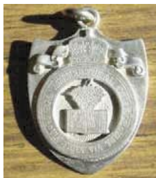
Ladies WACOBU Shield Pendant $65.00