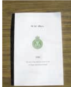
WAC 49er's Book POA