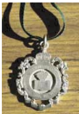
Ladies WACOBU Pendant $6.50