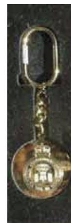
WACOBU Keyring $15.00