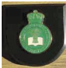
WACOBU Wall Plaque - $30.00